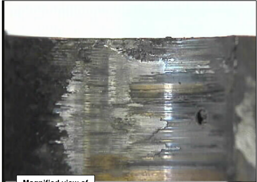
Magnified view of bearing surface

An inspection of this unit showed a wiped bearing. The timely identification of this failure mode saved our customer $100,000.00.